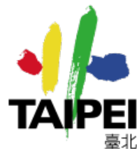
Taipei City Government